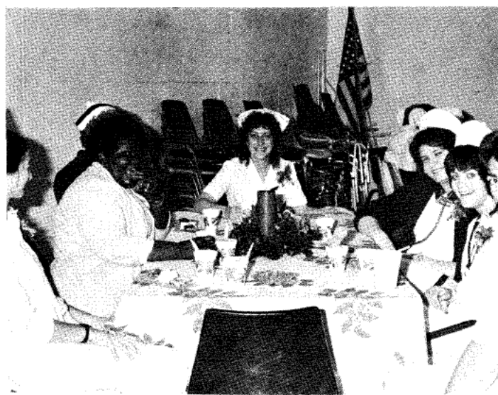
"OUR KIND OF FOLKS - WE LOVE YOU ALL"