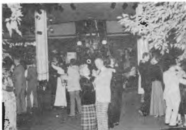
GRANITE RUN MALL CHRISTMAS PARTY